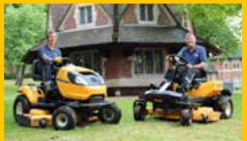
Cub Cadet At Bournville