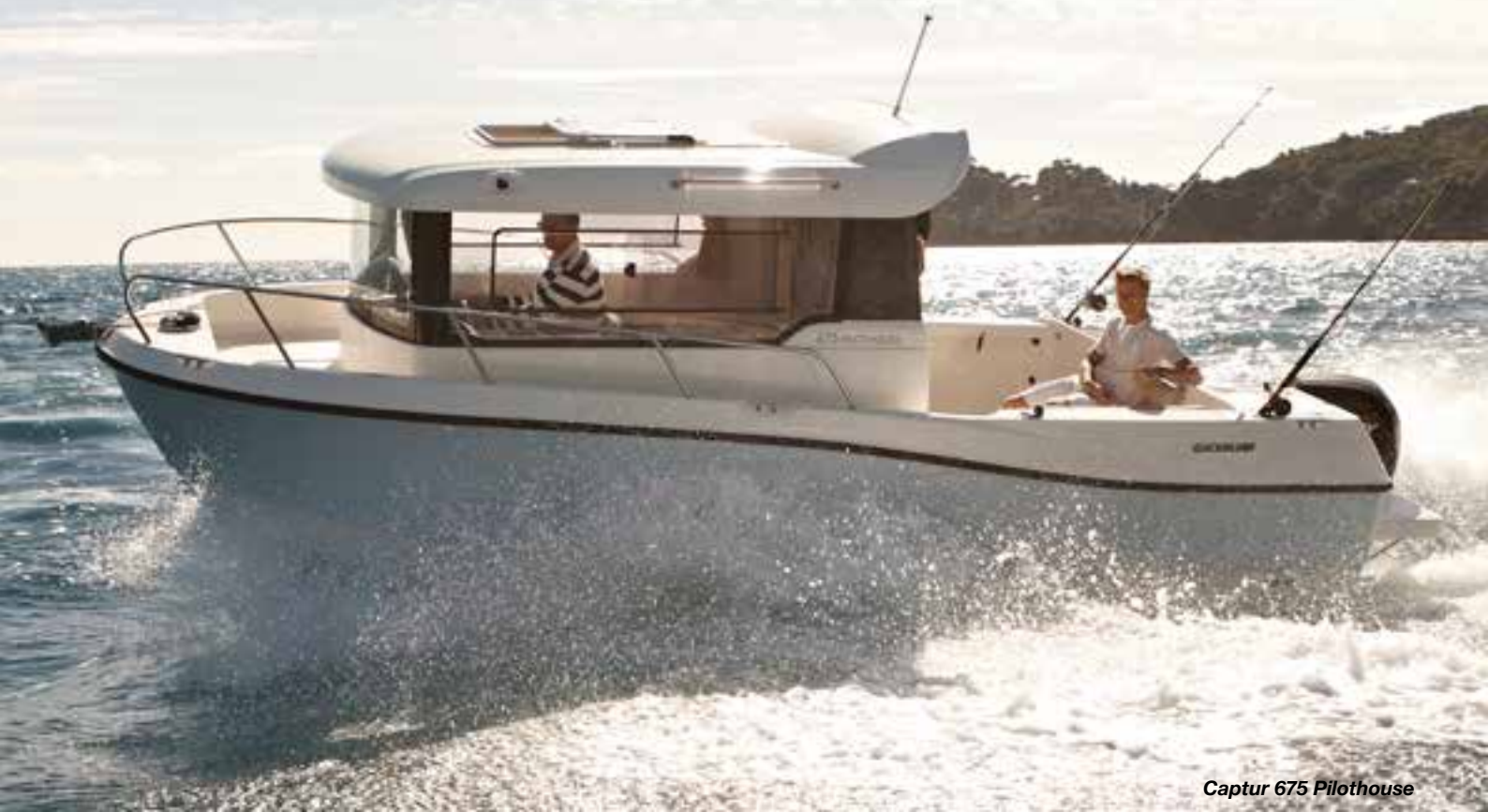
Captur 675 Pilothouse

The 605 Pilothouse can take up to a 150hp engine but also demonstrates excellent performance with 115hp. The 675 can be powered with up to a 200hp engine which will allow an effortless cruising speed of 25 knots.