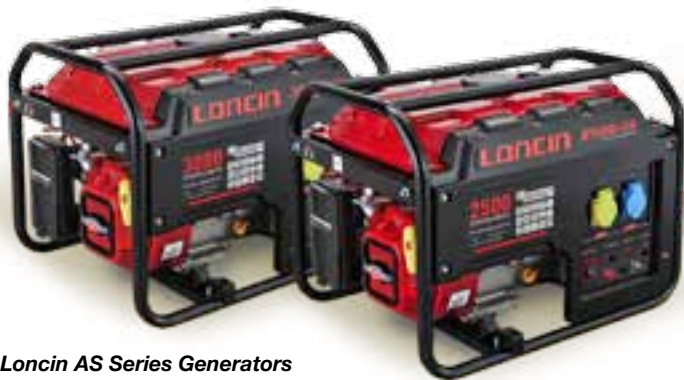
Loncin AS Series Generators