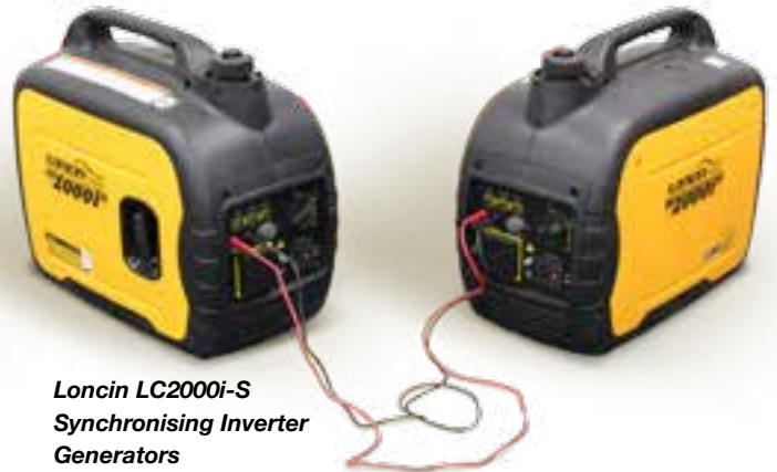
Loncin LC2000i-S Synchronising Inverter Generators