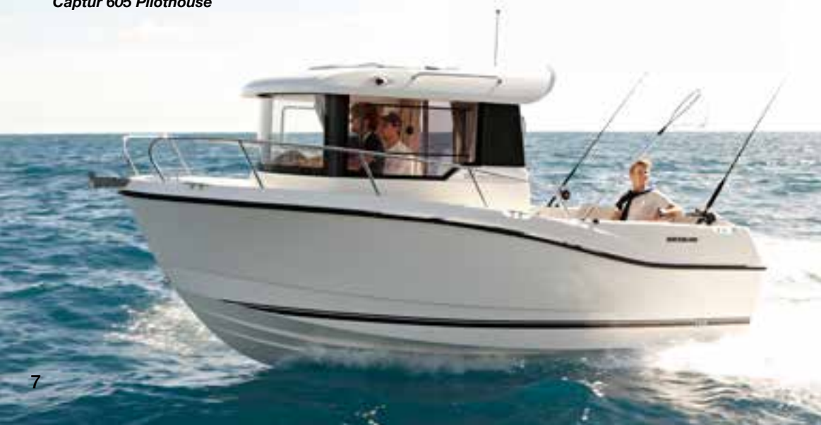
Captur 605 Pilothouse