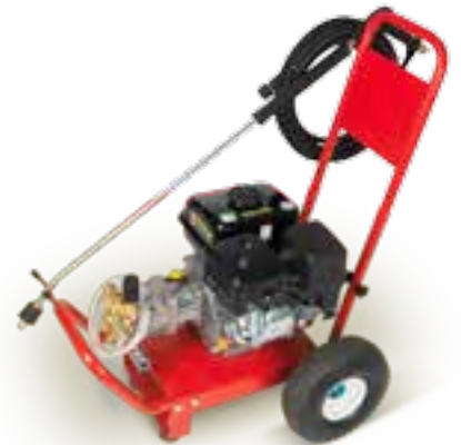
Loncin Pressure Washers

New to the range are two Loncin petrol engine powered cold water pressure washers. Trolley mounted, these portable, high-pressure washers are suitable for heavy-duty industrial applications. Detergent application facility comes as standard and the lance is connected to a high pressure hose capable of pumping 10.5 litres/minute.