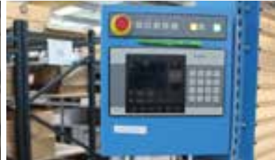
Clockwise from Left: Kardex Shuttle control panel, main distribution warehouse at Upper Heyford, two of the 6 Kardex Shuttles at Bicester headquarters.