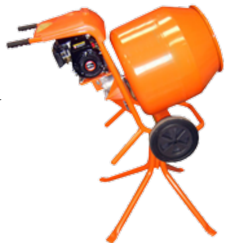
Example of a repowered mixer