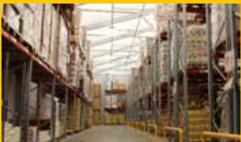
Barrus Undergoes Major Expansion