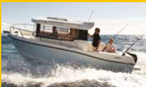
Fishing In Style With Quicksilver