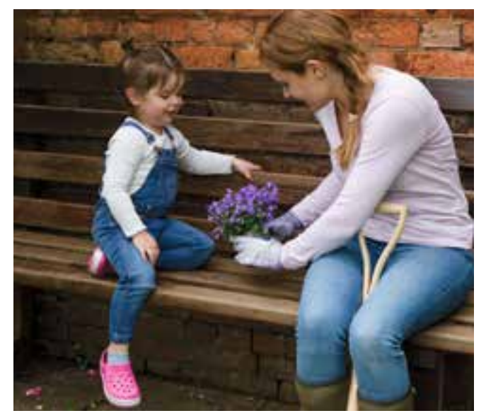
Kids Light-Up Cloggies

How do you make getting outside even more exciting for children? Add flashing lights of course! Brighten rainy days and winter walks with a range of light up footwear from Town & Country.