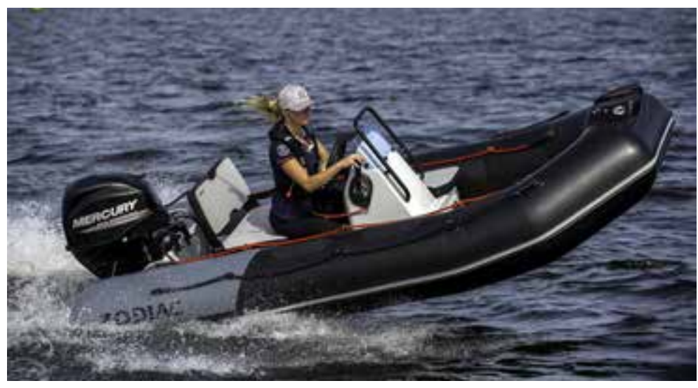
Zodiac OPEN 3.1