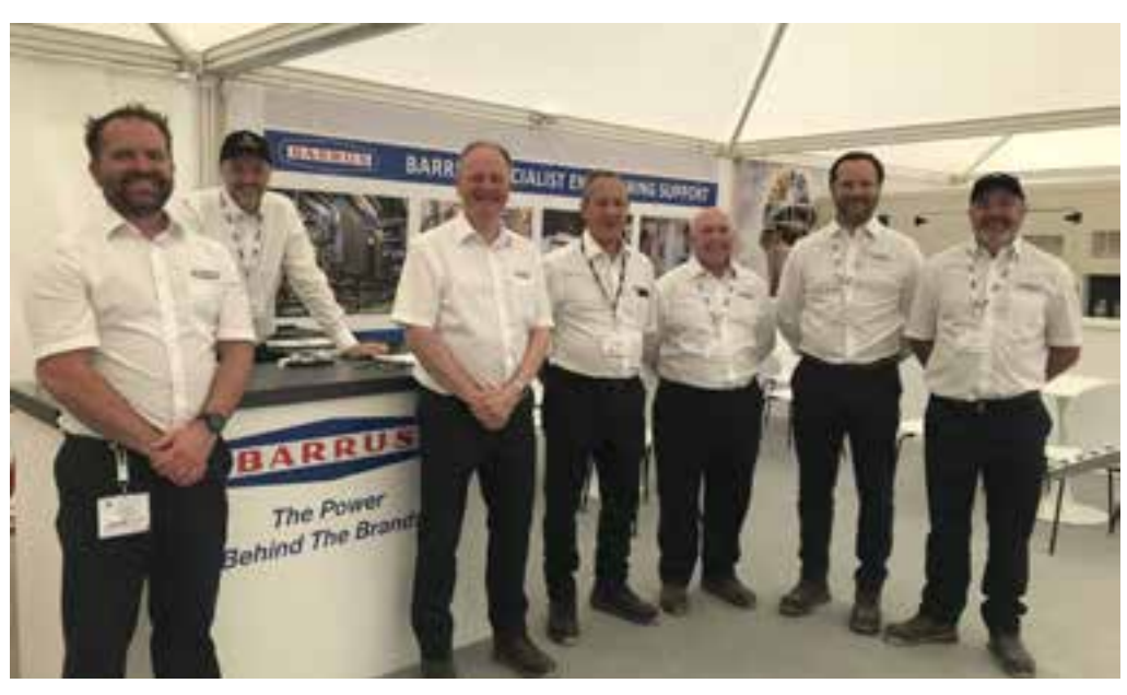
Barrus Industrial Team at Hillhead 2022