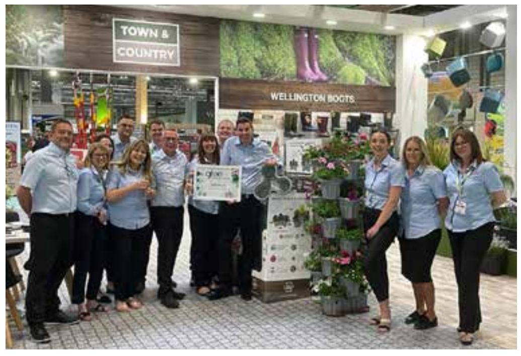
The Barrus Garden Tools Team at Glee 2022