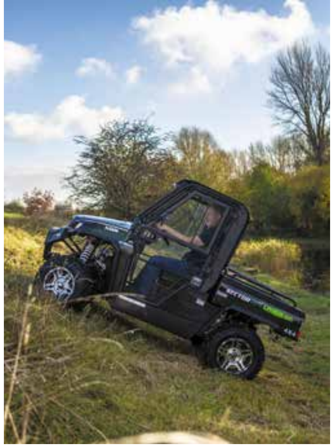
HiSun Sector 15kW Lithium-ion easily handles 45-degree inclines