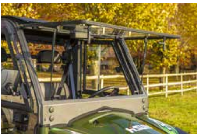
Tip-out windscreen for optimum airflow