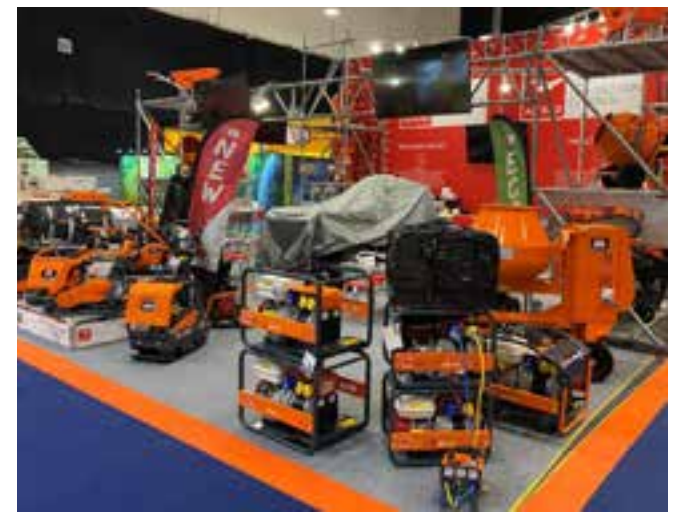
Loncin powered equipment on the Altrad Belle stand, Executive Hire Show 2022

Altrad Belle is an established manufacturer of light equipment for the building and construction markets with an extensive product range which they supply to rental companies and construction equipment retailers. The number of Belle machines fitted with Loncin engines has grown with applications including cement mixers, compactors, power poker units, water pumps and generator sets.