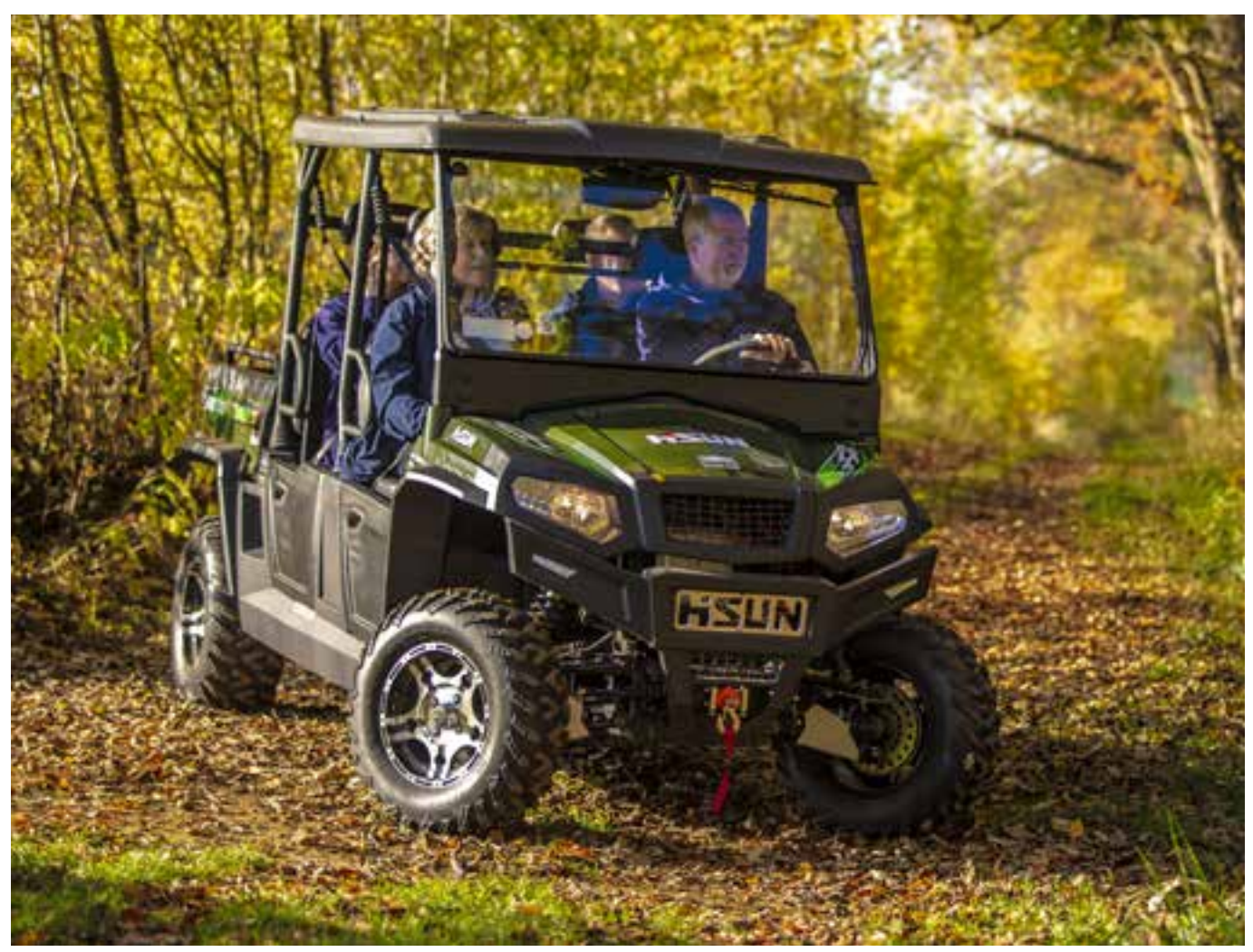
HiSun Sector 15kW Lithium-ion 4-Seater